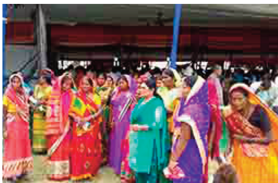
Krishi Mela at Champaran, Bihar

Awareness camps for VCA and EG & CGFS for FPCs organised in 3 States viz. Jharkhand, Chhattisgarh and Madhya Pradesh at 28 centres and Awareness camps is being organised for VCA and EG&CGFS for FPCs in 4 States viz. Maharashtra, Rajasthan, Orissa and Bihar.