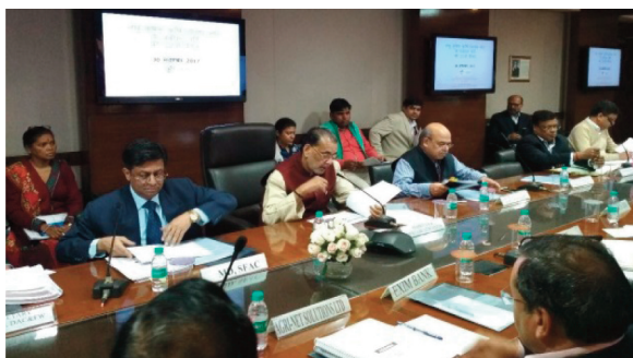
SFAC's Board of Management and Annual General Body Meeting held under the Chairmanship of Shri Radha Mohan Singh, Hon'ble Union Agriculture & Farmers Welfare Minister on 30.11.2017