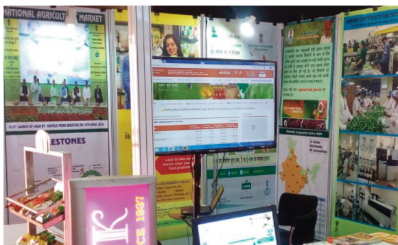
SFAC participated in India International Trade Fair