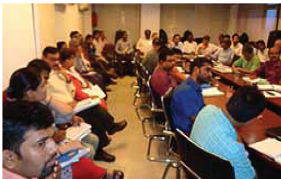
Review of Resource Institutions Delegates to SFAC