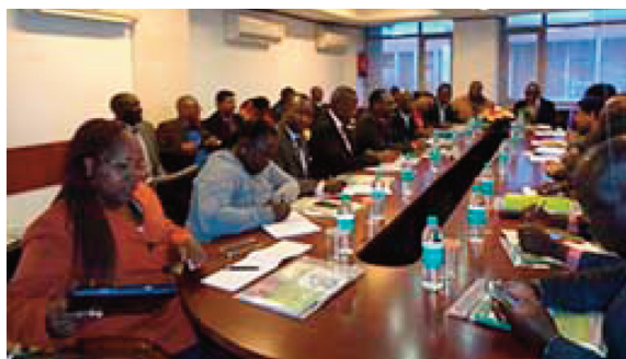
Visit of Kenya