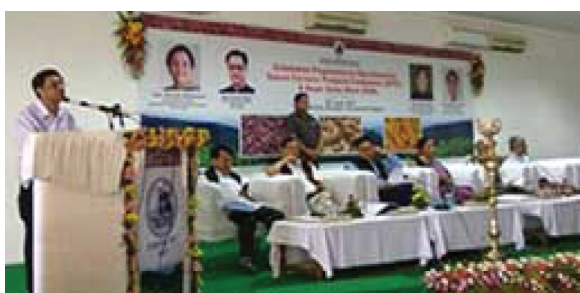
Orientation programme to operationalise spice farmers