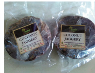
Retail outlet developed by FPOs of Tamil Nadu and West Bengal