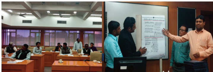
Training Programme for BoD